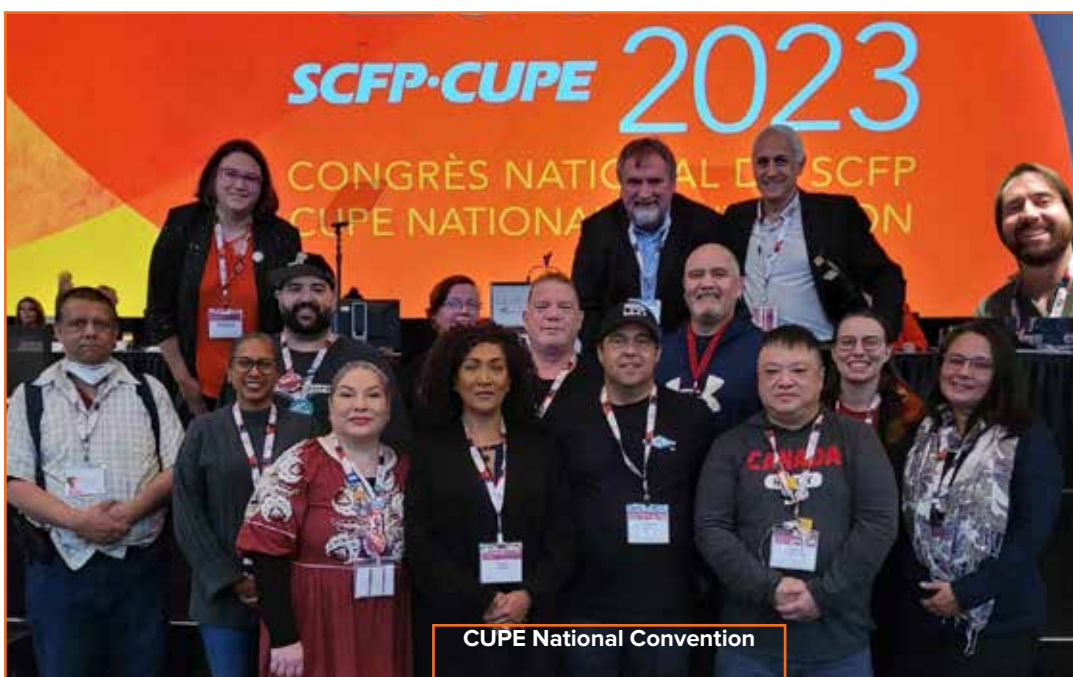
CUPE National Convention

We hope those who attended this wonderful event on December 9th enjoyed it. Unfortunately, the weather was not the best, but thankfully most of the activities were inside and the hot chocolate with candy canes kept everyone warm for a little while! Thank you to the social committee for all of your work and a very big thank you to our CUPE Local 15 members who work at Hastings Community Centre for all of your help to make ticket pick-up easy for everyone.