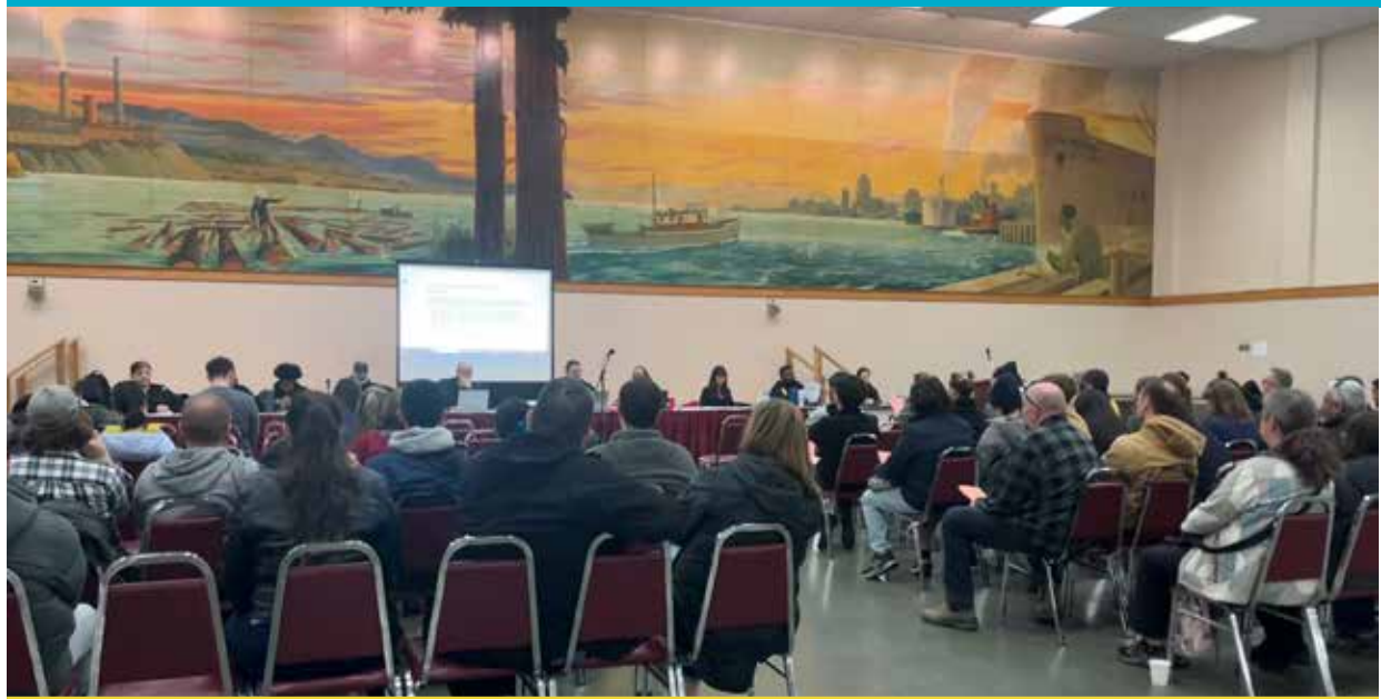
Members in the City et al Sector attend the Ratification of Agreement Information Meeting and Vote at the Maritime Labour Centre on November 17, 2023.