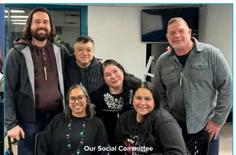
Our Social Committee