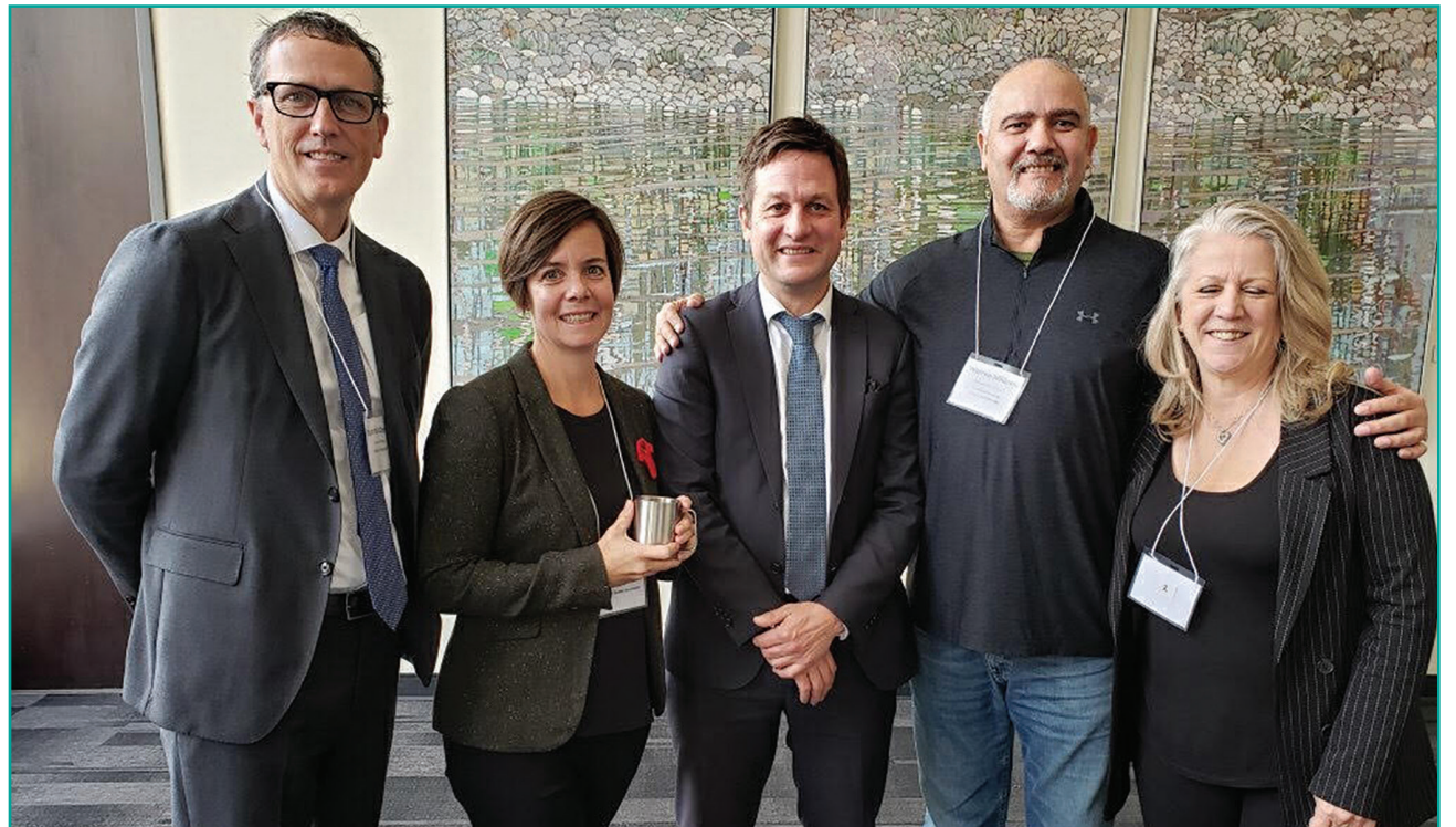
Excellent day of discussions with the Minister of Education, Rob Fleming, and -- on the K-12 Public School Funding Implementation Partner forum at SFU Harbourside.

We sincerely apologize and want you to know we are working very hard to rectify the accessibility issues with our building.