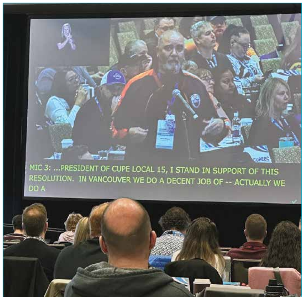
MIC 3: ...PRESIDENT OF CUPE LOCAL 15, I STAND IN SUPPORT OF THIS RESOLUTION. IN VANCOUVER WE DO A DECENT JOB OF -- ACTUALLY WE DO A