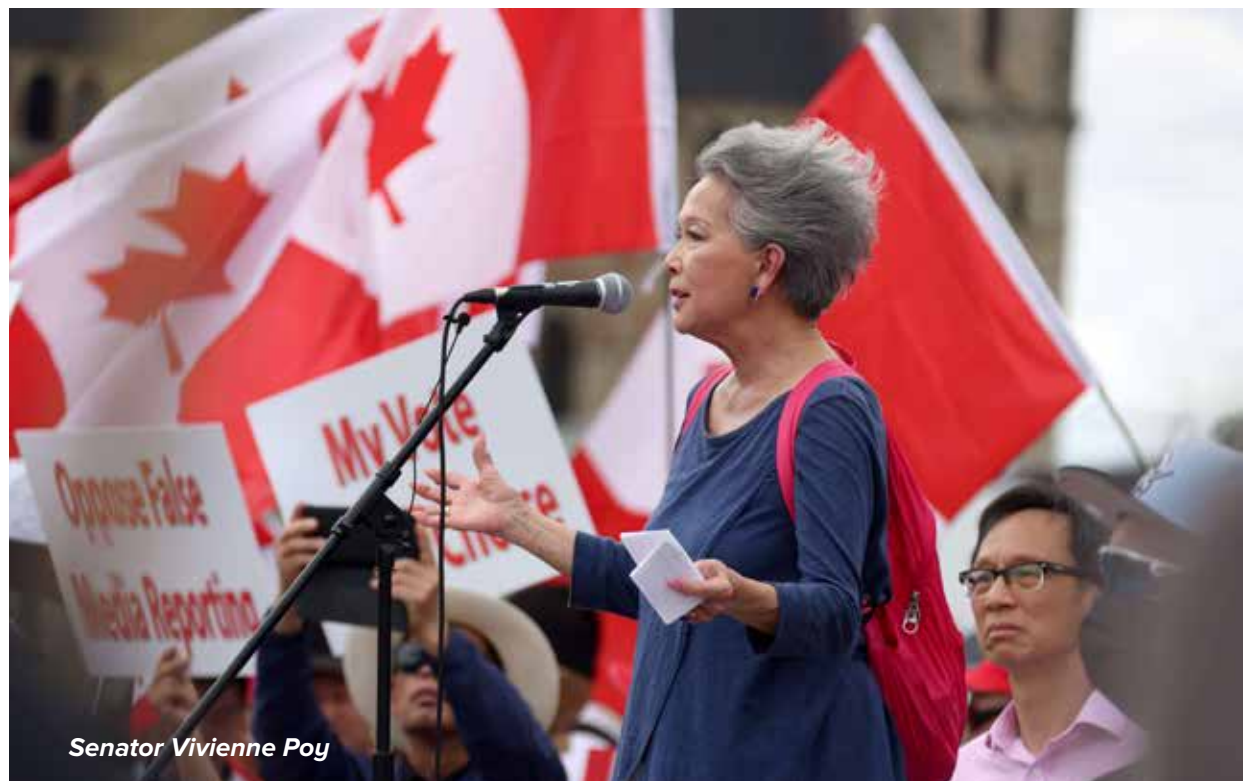
Senator Vivienne Poy

Over the last 2 centuries, immigrants have journeyed to Canada from East Asia, Southern Asia, Western, Central and Southeast Asia, bringing our society a rich cultural heritage representing many languages, ethnicities and religious traditions.