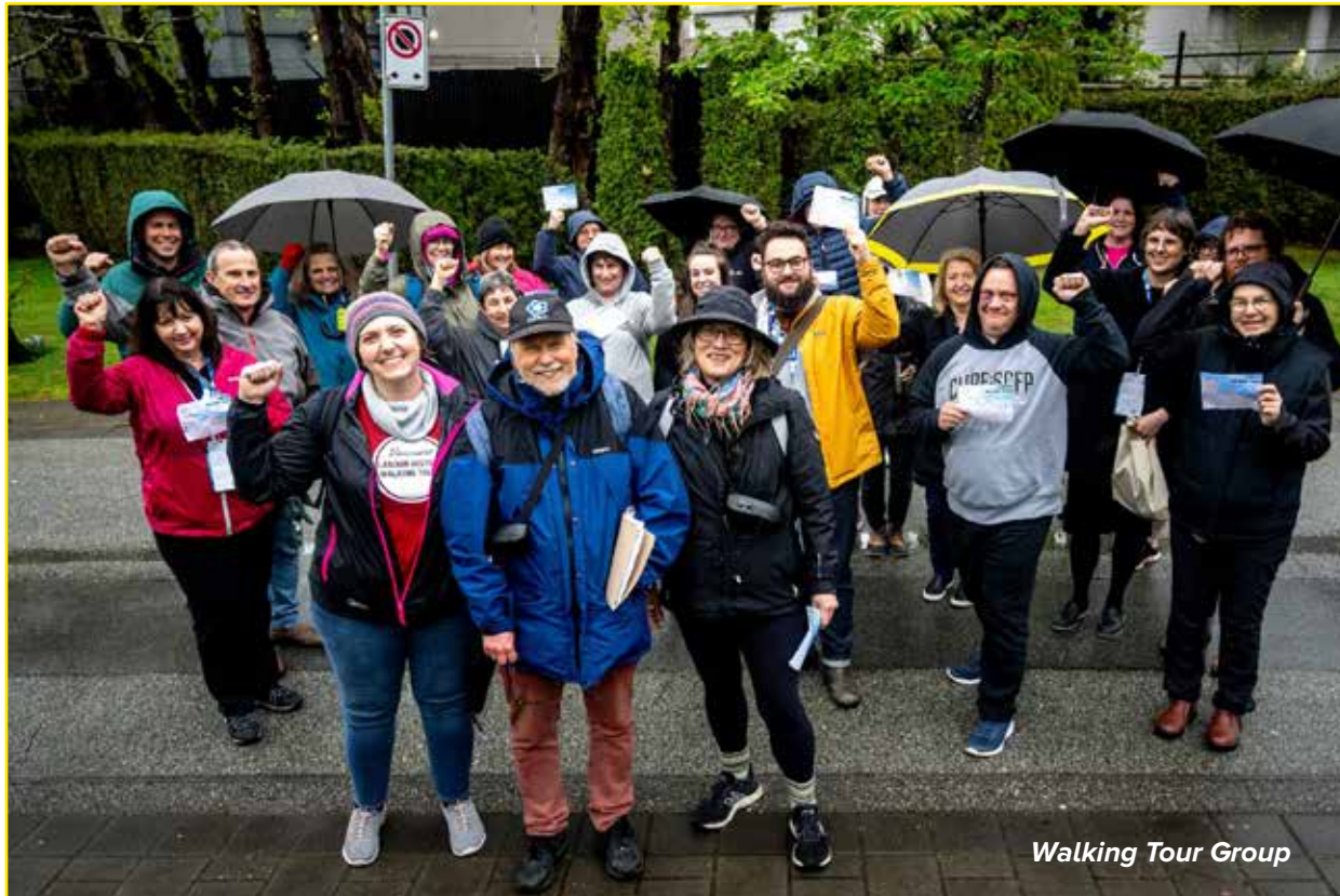
Walking Tour Group