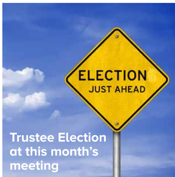
Trustee Election at this month's meeting