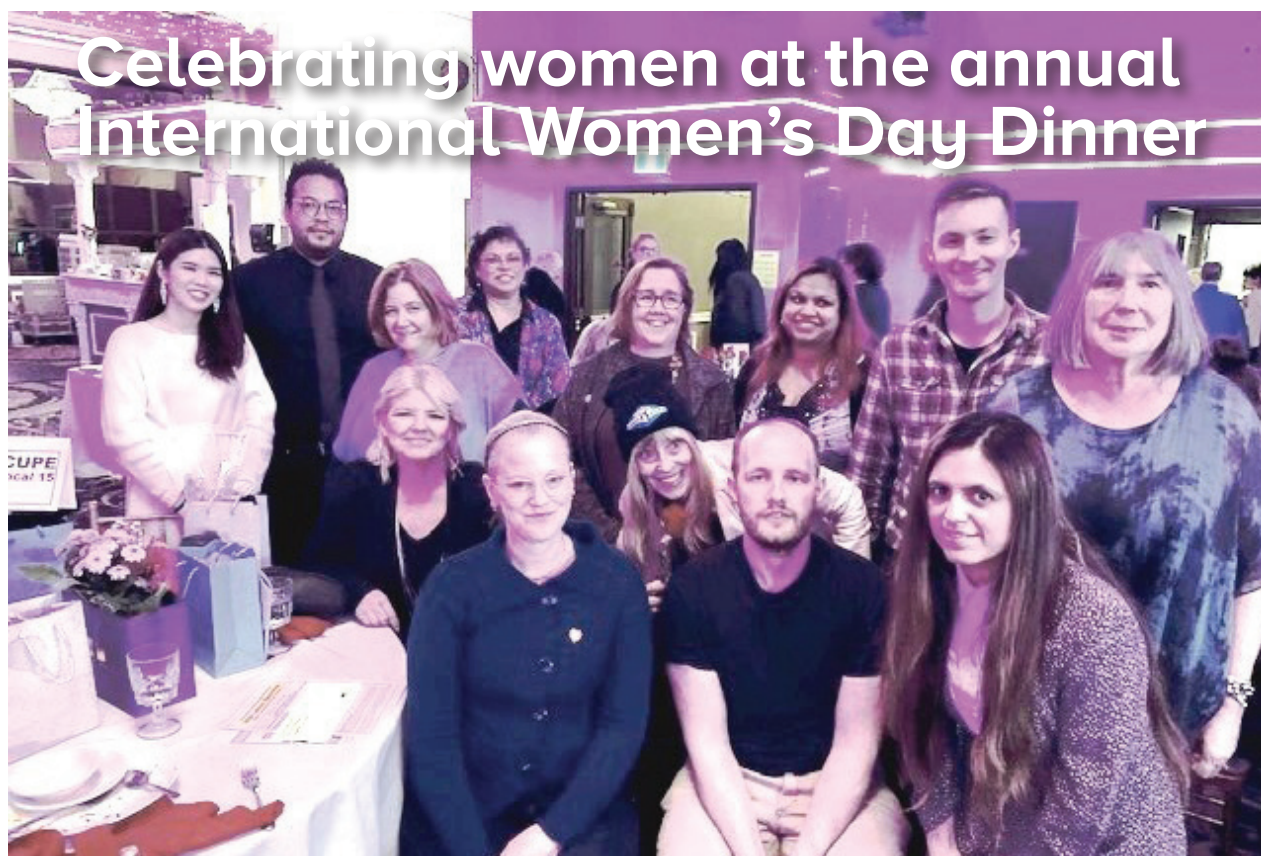
CUPE 15 had a good turnout for the VDLC International Women's Day Dinner with a theme of Joy and Justice.